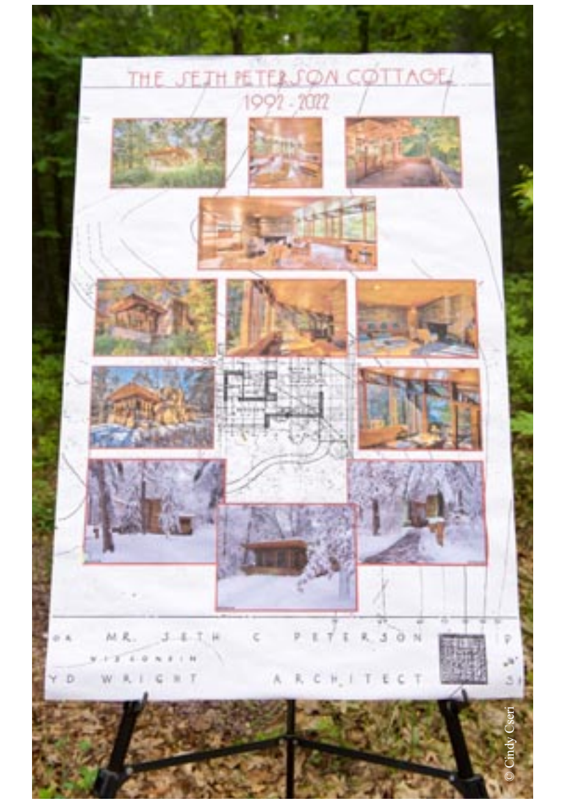
Approximately 300 people attended the Seth Peterson Cottage Conservancy's (SPCC) 30<sup>th</sup> anniversary celebration in June. The event included an open house, guided tours, music and comments from SPCC board and ex-officio members.