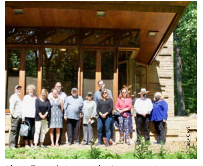
Above: Guests who have stayed multiple times at the cottage since it opened for overnight rentals in 1992 were recognized.